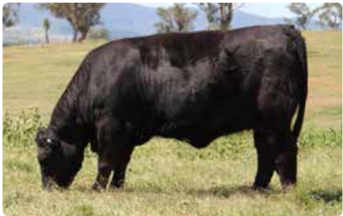
MALA-DAKI BLUEBELL P11 DAM OF LOT 36