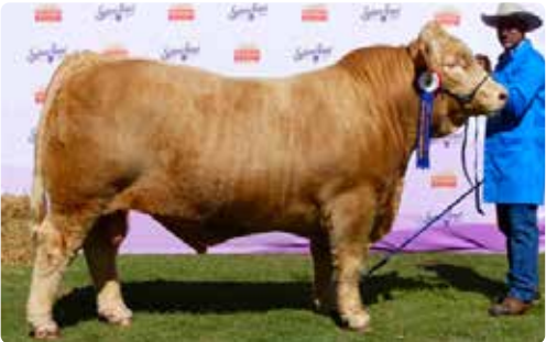
CALOONA PARK LITTLE HERO