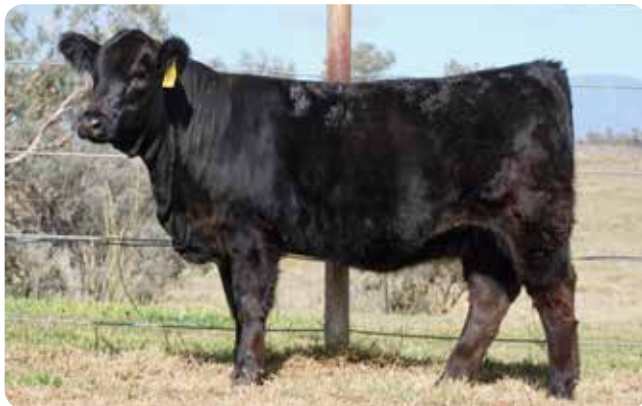
June 2022 Simmental Trans Tasman Breedplan

Comments A poll, homozygous black Simmental heifer sired by Mala-Daki Eldorado Q21. Ursula S70 is from an outstanding female line with a lovely nature and will make a huge influence in any herd. She had a birth weight of 39kg.