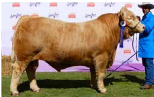
CALOONA PARK LITTLE HERO