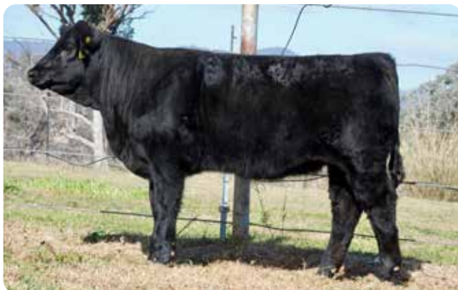
June 2022 Simmental Trans Tasman Breedplan

Comments A homozygous poll, homozygous black Simmental heifer sired by Mala-Daki Eldorado Q21. Sarsparilla S74 is from the best female line in our herd, naturally curious and calm, and will definitely have a huge impact as a future breeder. She had a birth weight of 32kg