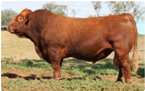
MALA-DAKI RED AMIGO K649 (PP) (AI)