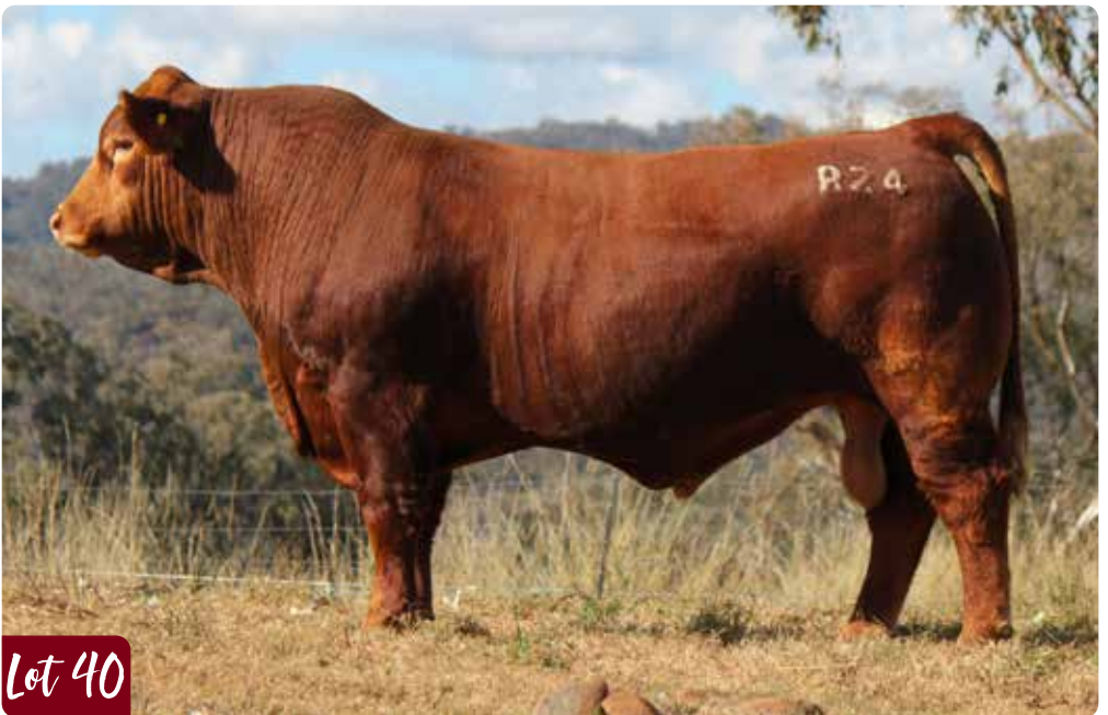
JN CATTLE CO THE FORCE R100 (Pp) (AI) (B)