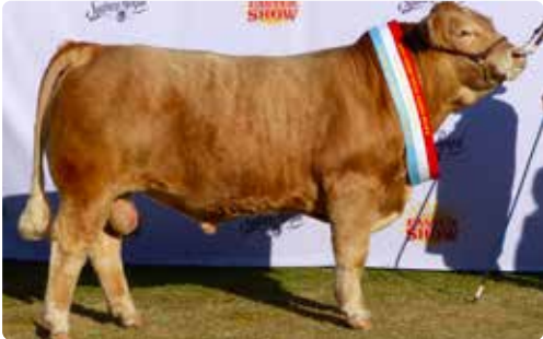
CALOONA PARK NUGGET