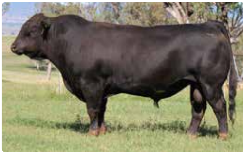
MALA-DAKI ELDORADO N33