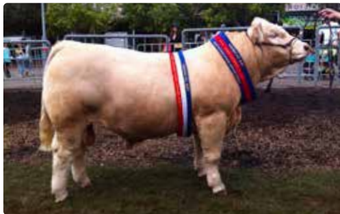
2014 SYDNEY ROYAL CALOONA PARK HERO