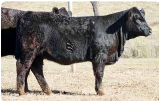
June 2022 Simmental Trans Tasman Breedplan

Comments A homozygous poll, black Simmental heifer sired by Mala-Daki Eldorado Q21. A very complete and stylish heifer with a lot of potential. She had a birth weight of 37kg.