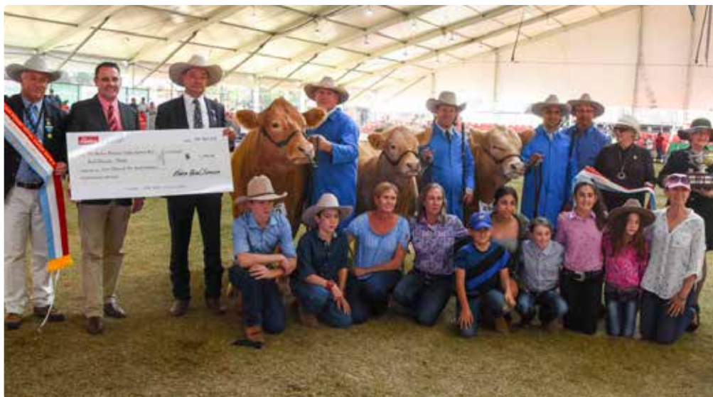
2019 SYDNEY ROYAL - THE HORDERN PERPETUAL TROPHY