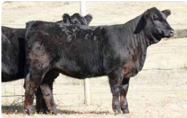
June 2022 Simmental Trans Tasman Breedplan

Comments A homozygous poll, homozygous black Simmental heifer sired by RJY Shock N Awe. Black One S52 is a sweet and stylish heifer with a lot of potential. She had a birth weight of 39kg.