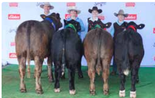
2022 SYDNEY ROYAL MALA-DAKI STEER TEAM