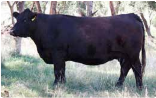
MALA-DAKI BLACK HAZEL K663 DAM OF LOT 37