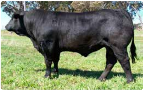
MALA-DAKI BULLDOZER E421