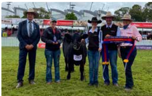
2022 SYDNEY ROYAL CALF CHAMPION FEMALE