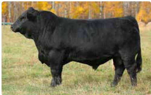
RGY SHOCK N AWE 5W (P) (B) (AI)