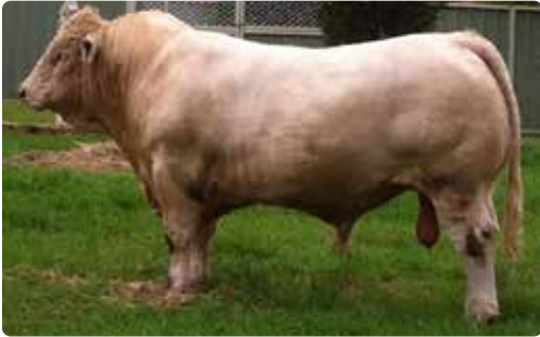
CALOONA PARK GLADIATOR