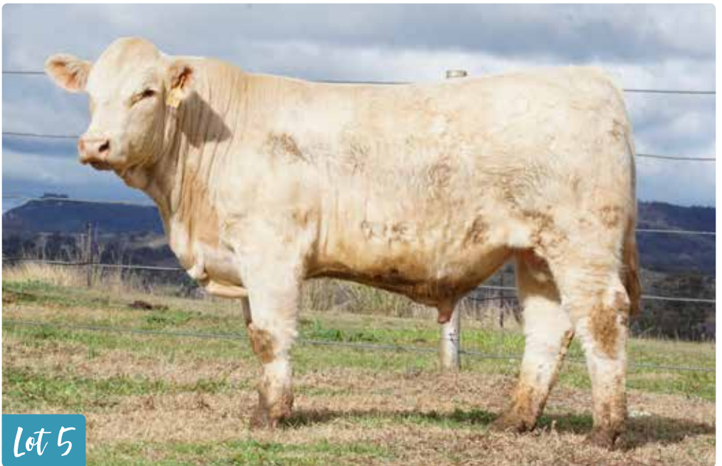
CALOONA PARK RIPPER (P)